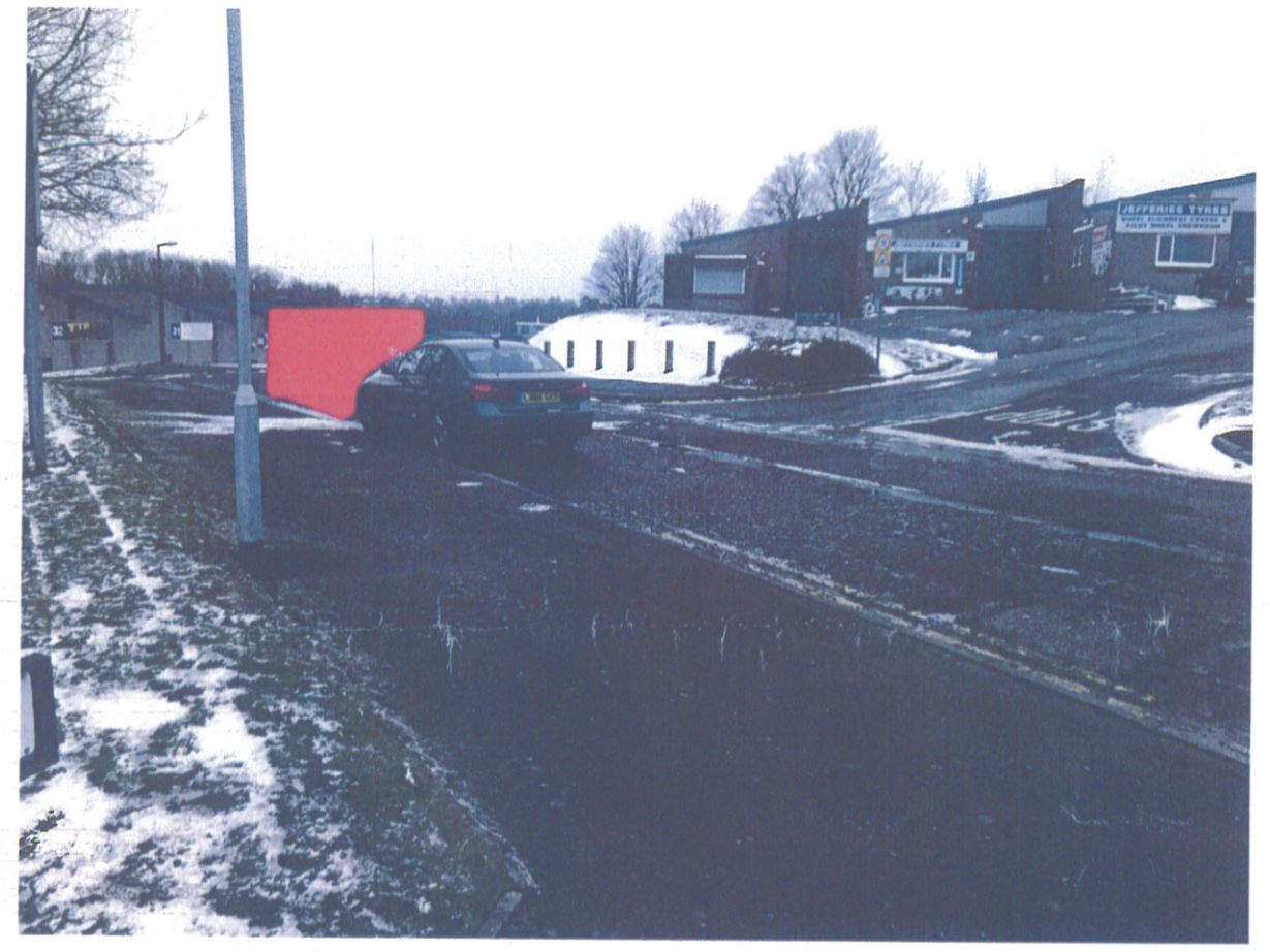
This is our proposed site on Sugarbrooke Rd The exact spot is just infront of where this BMW is parked (red mark)